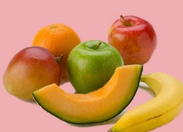
15 g carbohydrate per serving